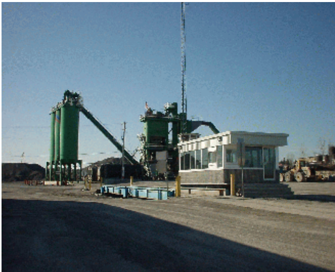
New Rideau Road Weigh Station

We also made improvements to our lab, including the purchase of a gyratory compactor to assist us in the use of superpave technology.